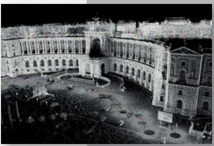
scan data detail, reflectance-scaled