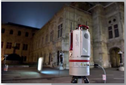
RIEGL VZ-400i night scan in Vienna

One of the fastest scanners on the market: 500+ scans (50 mdeg) within 8 hours, handled by one operator!